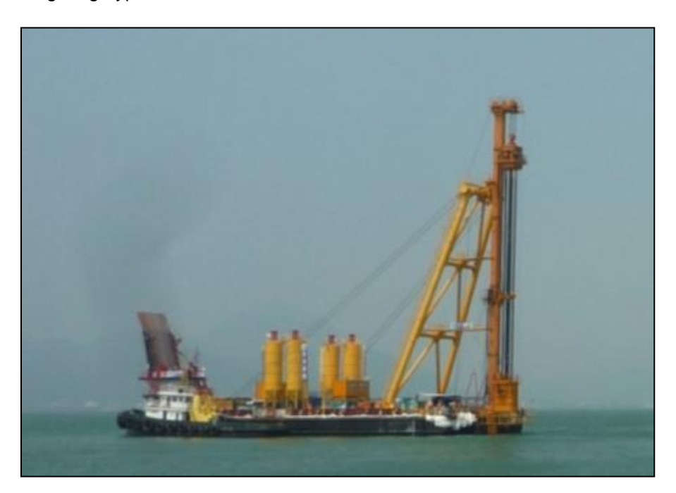
Multiple-rig Type DCM